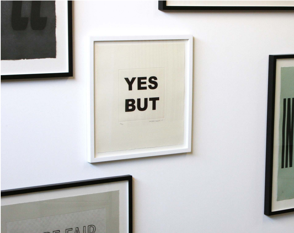
6. Various prints from 'Stringing a Line' at Bainbridge Studios, November 2010