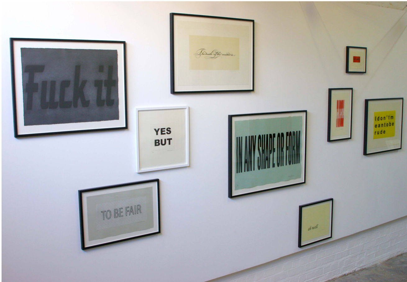
2. Various prints from 'Stringing a Line' at Bainbridge Studios, November 2010