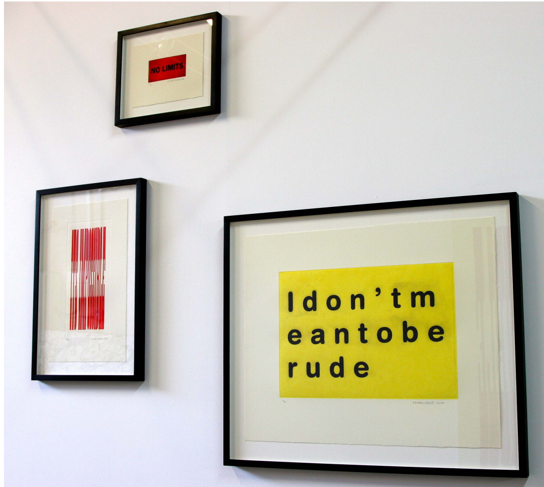
3. Various prints from 'Stringing a Line' at Bainbridge Studios, November 2010