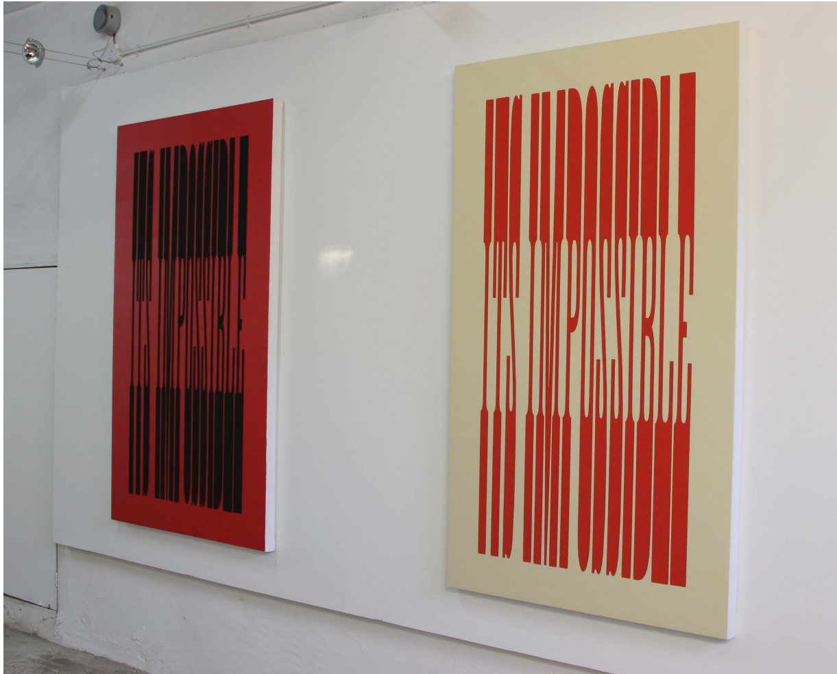
8. 'Its Impossible' (cream version). 2010. Acrylic and fabric on linen, 176 x 113cm.