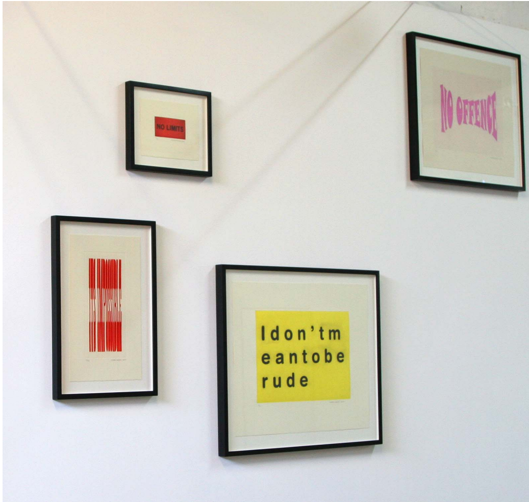
5. Various prints from 'Stringing a Line' at Bainbridge Studios, November 2010