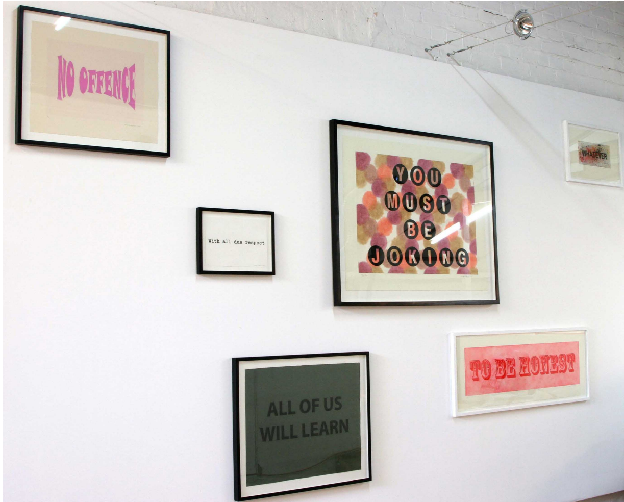
1. Various prints from 'Stringing a Line' at Bainbridge Studios, November 2010