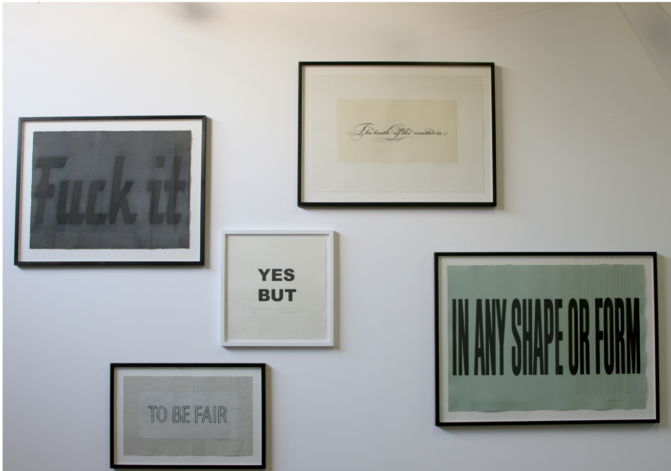
4. Various prints from 'Stringing a Line' at Bainbridge Studios, November 2010